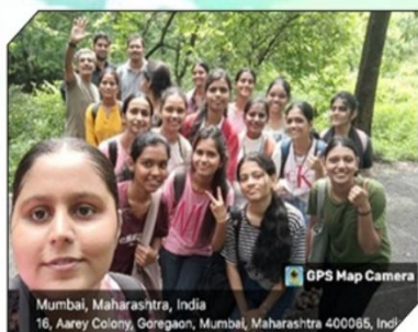
Tree Plantation Walk, Aarey Colony. 11 th August, 2024