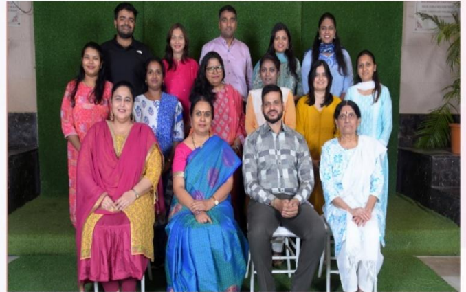
Faculty of Smt. K.G. Shah Department of Computer Applications