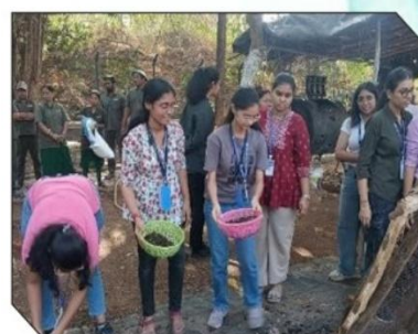
Workshop on 'Exploring Sustainability' at HBCSE, 5 th March, 2025