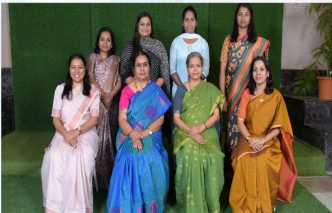
Faculty of Smt. Hiraben Manilal Nanavati Junior College of Home Science