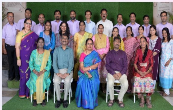
Non- teaching staff of Dr. B.M.N. College of Home Science