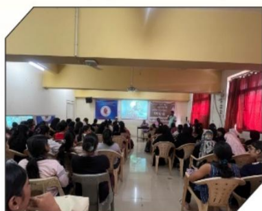
A session for BSc and BCA students on 'Relevance of Mahatma's Values in Modern times' by the Bombay Sarvodaya Mandal members, 9 th January 2025