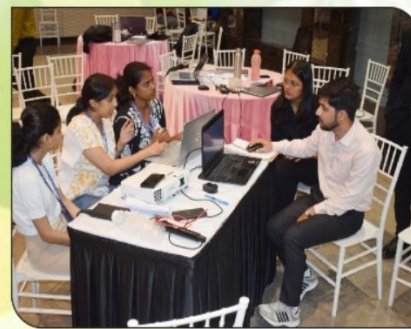
Final Round - Team presentations