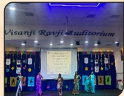
SCNI Polytechnic Department of Fashion Design's "Walking the Ramp"