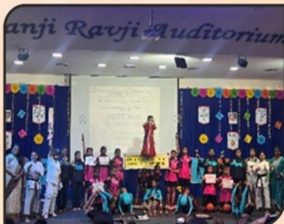
A dynamic showcase of the sports journey by students of Dr. BMN and HMN Colleges!