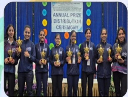
Annual Prize Distribution Ceremony, 8 All India-level athletes honored for excellence in sports, 13 th March 2025.