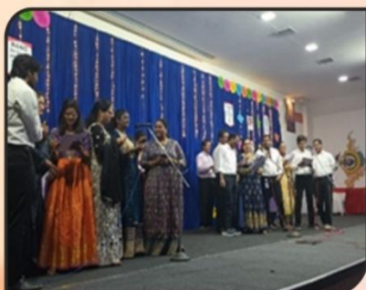
Singing Marathon Performed by Non-Teaching Staff theme – Retro vs Modern