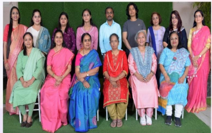
Faculty of Smt. Shardaben Champaklal Nanavati Institute of Polytechnic