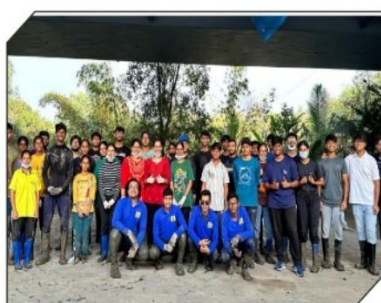
Mangrove Cleanup, Airoli, 30 th December, 2024.