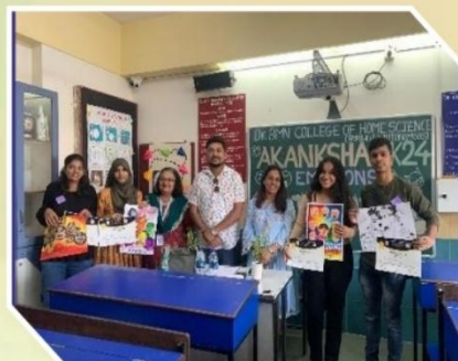
Winners of the Face Painting Competition