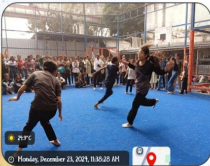
Kabbadi Competition, Day 1, Annual Sports Festival, 23 rd December 2024