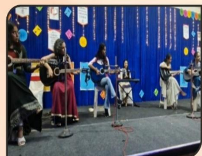
Musical showcase featuring singing and guitar by B.Sc. teachers and students.