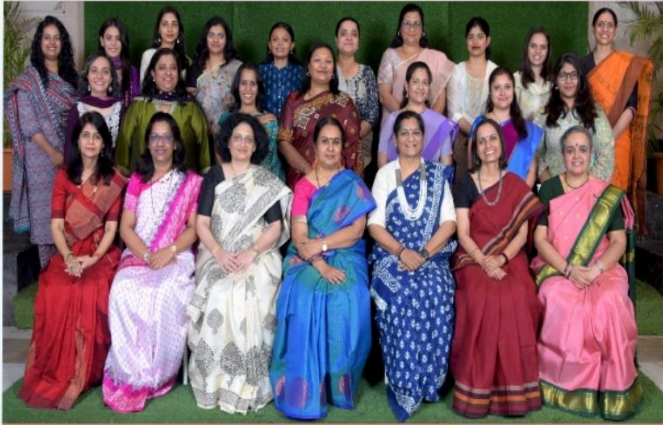
Faculty of Undergraduate & Postgraduate Programs in Home Science