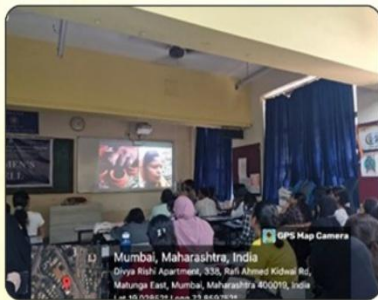
Film Screening in collaboration with MAVA on 'Reel to Real: Exploring Gender Through Cinema', 3 rd March 2025