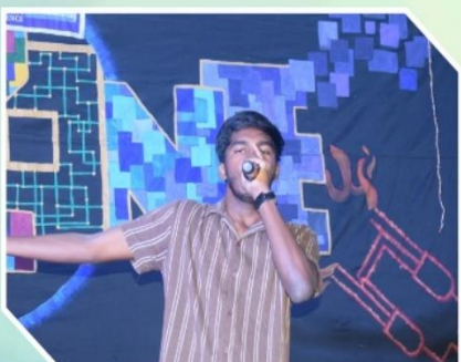
Beatboxing - Beatzilla Event