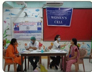
Dental Camp held on campus for students and non-teaching staff in collaboration with Team Parivartan and Government Dental College, Mumbai on 27 th March 2025.