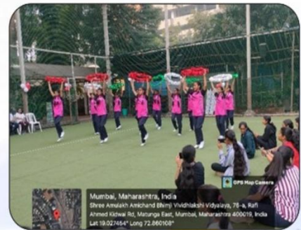
Day 2, Hoops display Annual Sports Festival, 24 th December, 2024