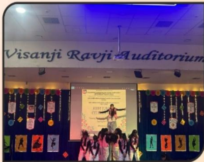
Fireflies dance performance