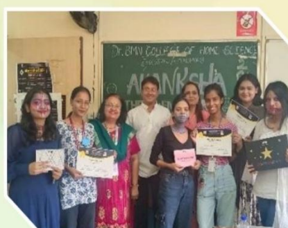
Winners of Cartooning competition