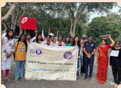
Avhaan - Disaster Management Camp from 7 th to 16 th November, 2024