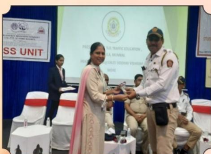
Awareness lecture on “Road Safety” on the occasion of Road Safety Week in collaboration with Nehru Yuva Kendra Sangathan, Mumbai, 18 th January 2025