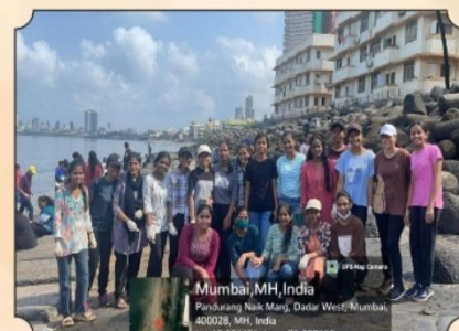
Swachata Hi Seva - beach clean-up drive post-Ganpati Visarjan at Chatrapati Dadar Beach, in collaboration with Green Club, 21 st September, 2024