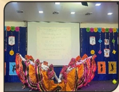
Haryanvi Folk Dance by the college dance team.