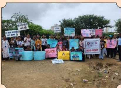
“Peace Rally” (in memory of the victims of Hiroshima and Nagasaki atomic bombings), 6 th August, 2024