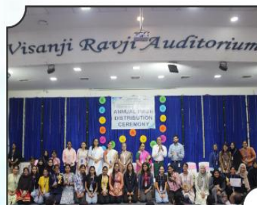
Prize Winners felicitated