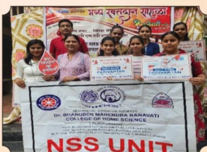
Blood donation camp, Sion, organized by “Unique Blood Motivators”, 1 st January, 2025