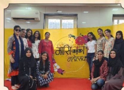
“Masika Mahotsav at Krishnachiwadi, Asangaon in collaboration with Muse Foundation, 7 th July, 2024