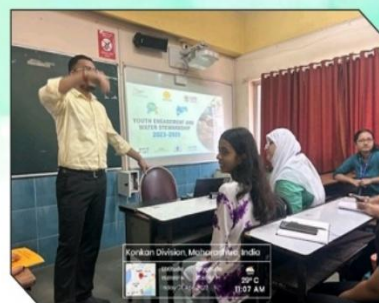
Symposium on 'Enriching Green Club Activities on Campus' 21 st August, 2024