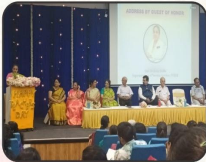
Teachers' Day Celebration, Chief guest: Shri. Chetan Desai, District Governor, Rotary District 3141, 5 th September, 2024