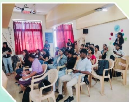
Techie Tokens Event