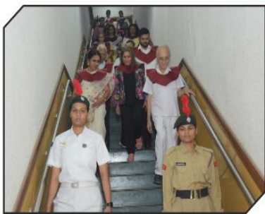
Marching with the Chief guest