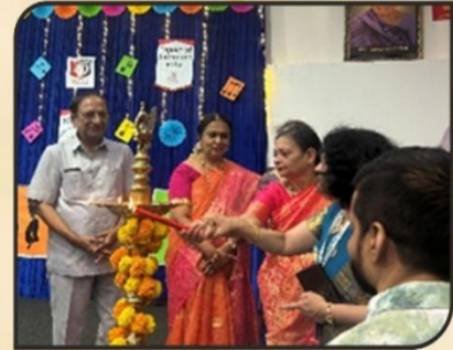
Lighting the lamp