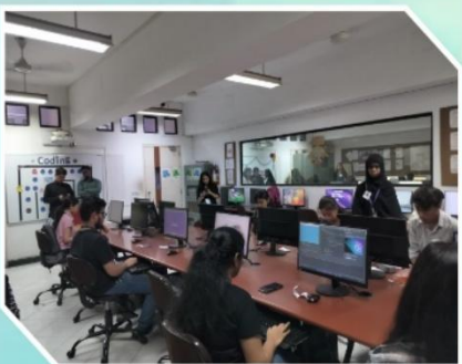
Game Forge Event