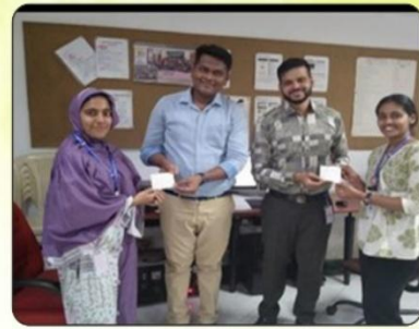
International Men's Day, 19 th November 2024