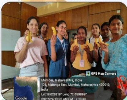
Year-round nutrition supplementation scheme to boost sports fitness