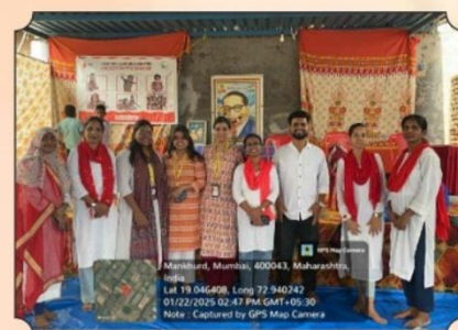
Education Awareness Day program at Maharashtra Nagar and Shivaji Nagar Mandala, Kalwa from 22 nd to 29 th January, 2025